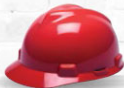
V-Gard Cap Class E Type I