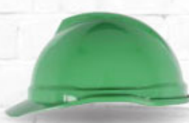
V-Gard 500, Non-Vented Class E Type I