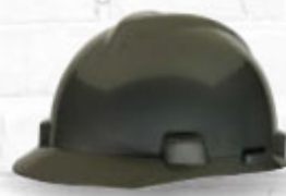
V-Gard Super V Class E Type II