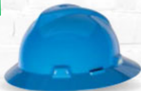
V-Gard Hat Class E Type I