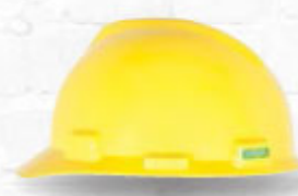
V-Gard Green Class E Type I